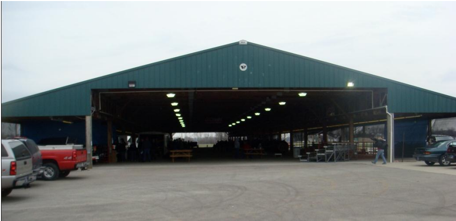
New View Coming Soon!!!!

During the 2010 Bartholomew County Fair, we were blessed with a VERY full Livestock Barn. With the support of our Platinum Sponsor, Bartholomew County REMC, we will be building a barn extension. The new extension will be approximately 48'x102' with a new walkway about 18'x24'. The existing awning on the Pavilion will be replaced to match and tie into the new walkway.